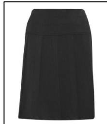
Black pleated school skirt